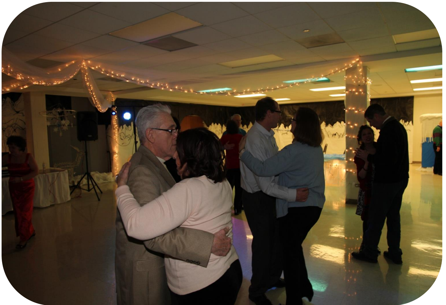
The committee did an unbelievable job transforming the cafeteria into a winter wonderland.