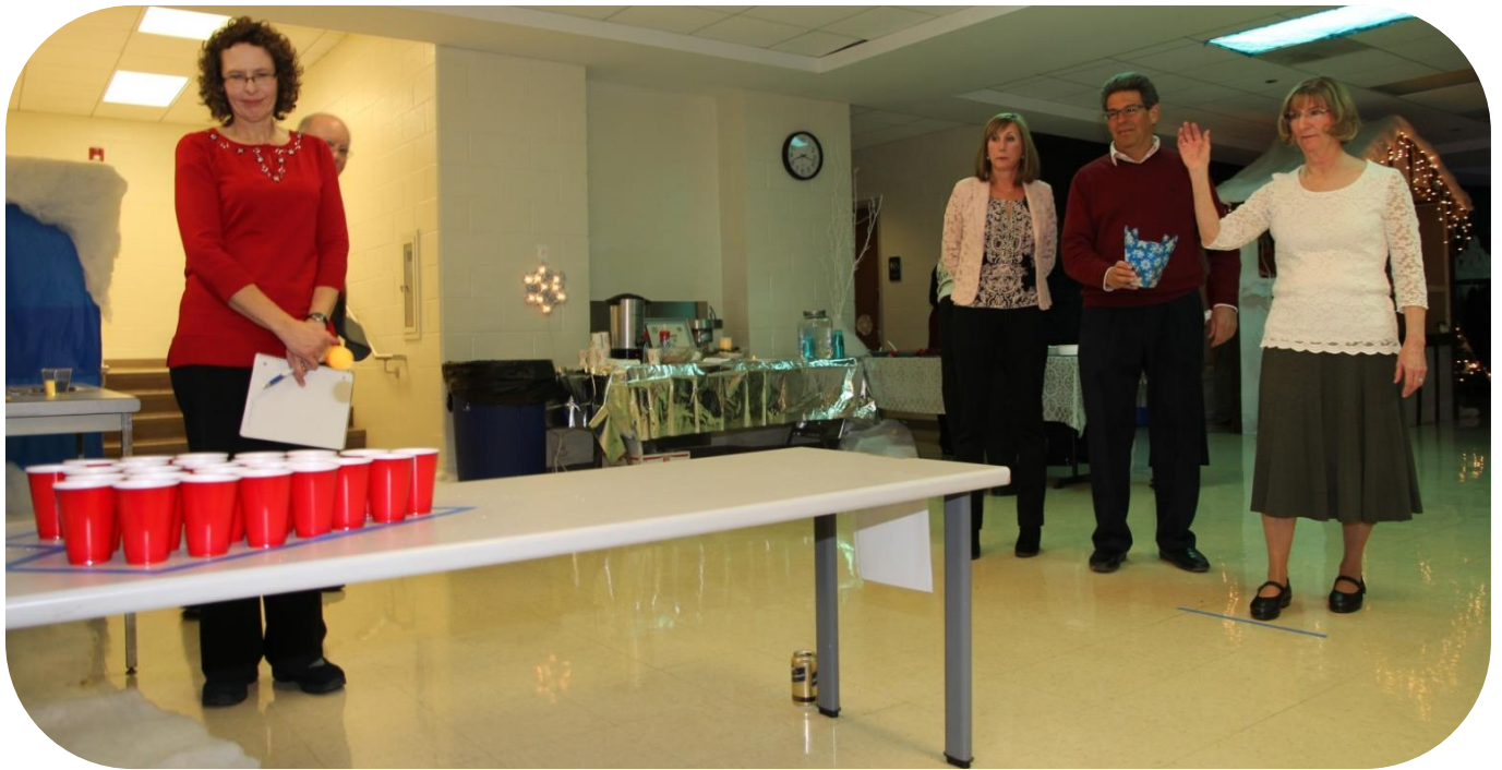
Adult Bozo Buckets provided a lot of laughs.