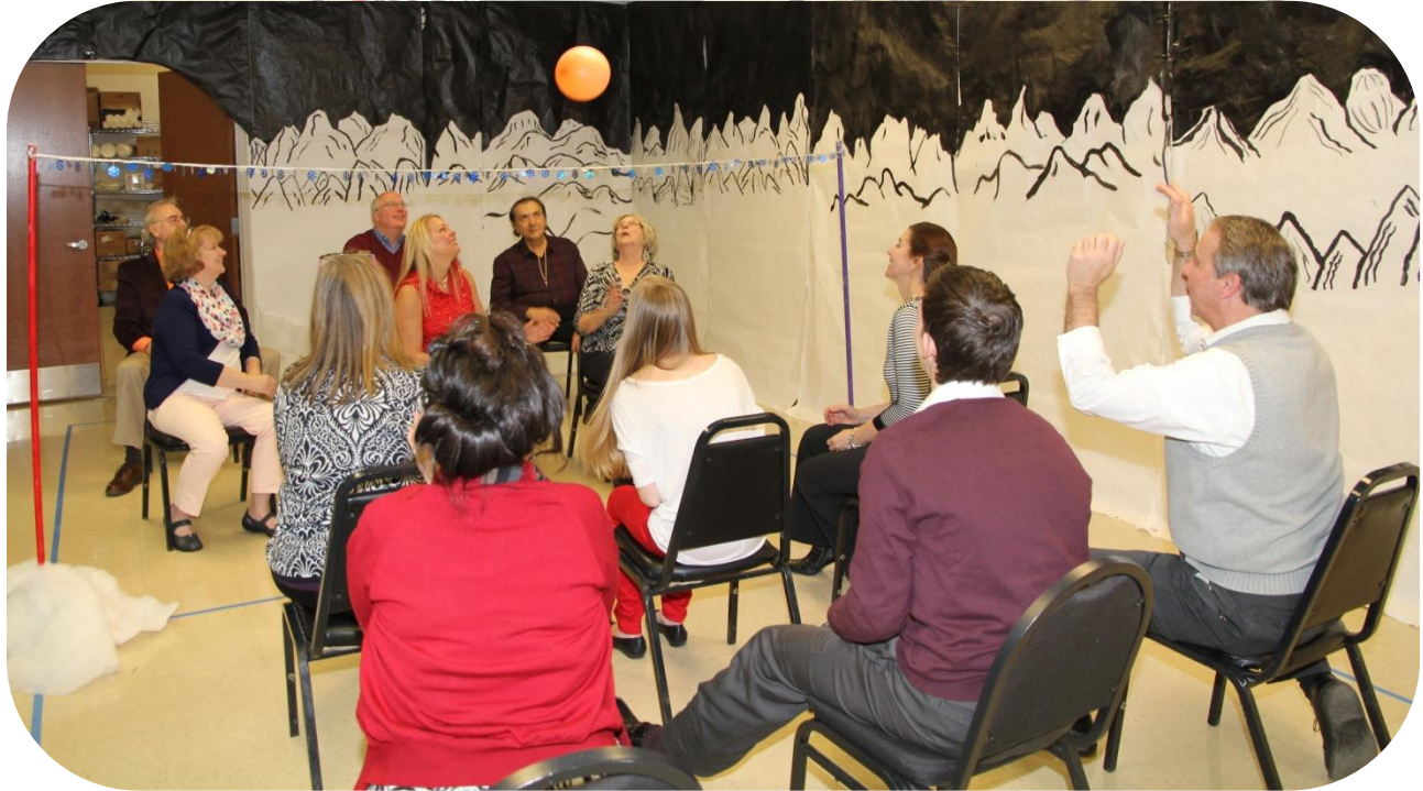
Balloon Volleyball was a blast!

Great Fellowship, Good Food, Fun Games & Dancing