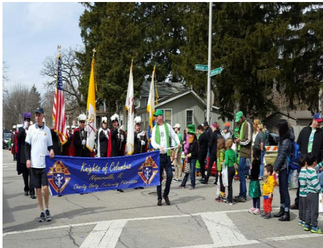
Naperville St. Patrick's Day Parade